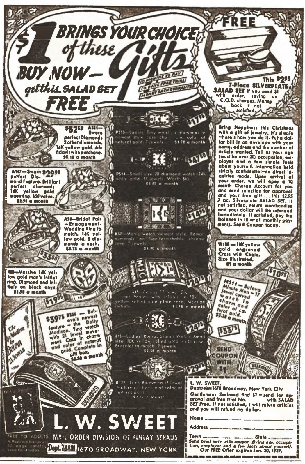
PLEASE mention NEWSSTAND FICTION UNIT when answering advertisements