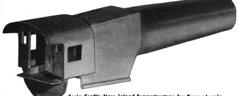
Scale-Craft's New Joined Superstructure for Pennsylvania, Southern Pacific and S. P. Mountain Type Locomotives

At no extra cost we now offer Kits for tages! Pennsylvania K4, Southern Pacific Mountain Type, and S. P. 13 Locomotives, with the following parts joined together— Tapered Boiler Section; Fire Box Joint pictures of famous model systems, plans and tech-Casting; Fire Box, Fire Box Back Plate; Formed Cab; Cab Front and Back Castings; and Cab Floor. Thus, with the most difficult operations all completed, there remain only the easier tasks of cleaning